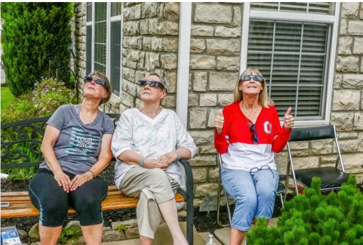
The Herlan House was a gathering place for the eclipse.