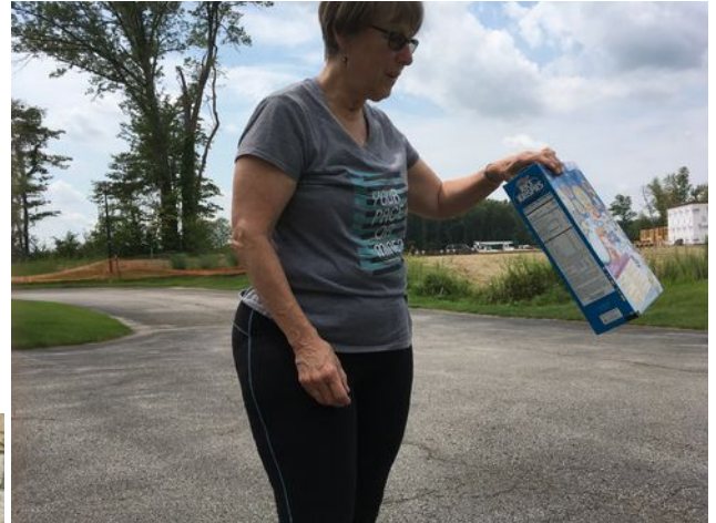
Cereal box safe Sun viewer ("camera obscura" or "pinhole camera")