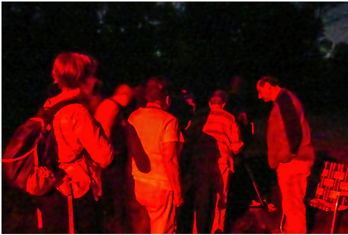
Queued to look through one of the many CAS telescopes on the observatory lawn.

Resident Stu Herlan took photographs during the program. A few of them are shown here.