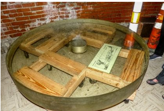
69 inch diameter mirror for original (1931) Perkins observatory telescope