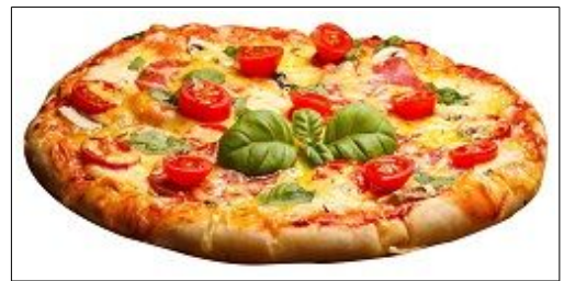
Our pizzas didn't look exactly like this.

The pizza party in January was a huge success with 18 residents attending. Lots of great food including salad and yummy desserts along with the pizza. The next pizza get together is on Friday, March 3.