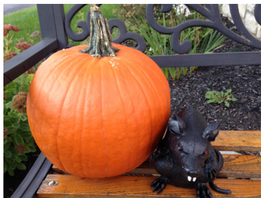
Are there evil rats in Glenabby?