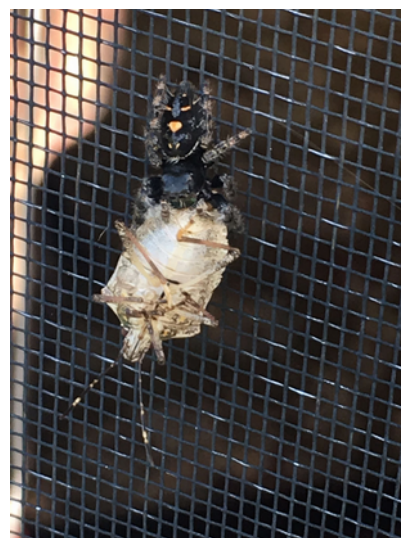
YUM! Stinkbug snack!