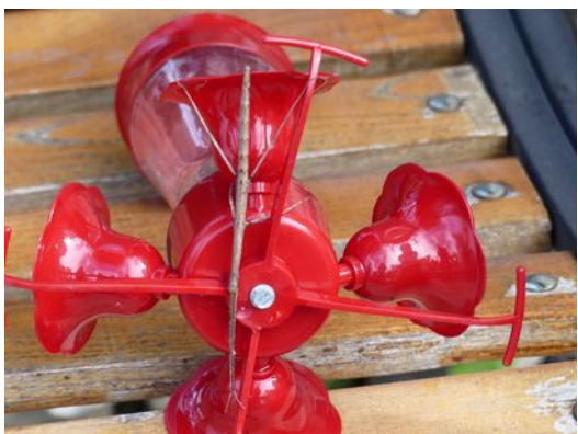
... and apparently, walking sticks, too!