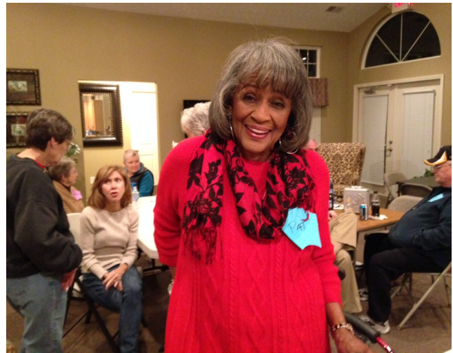
Enjoying the Holiday Party...